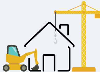
Vacant stock, conversions, closures & demolitions