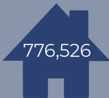
2016 NI Housing Stock