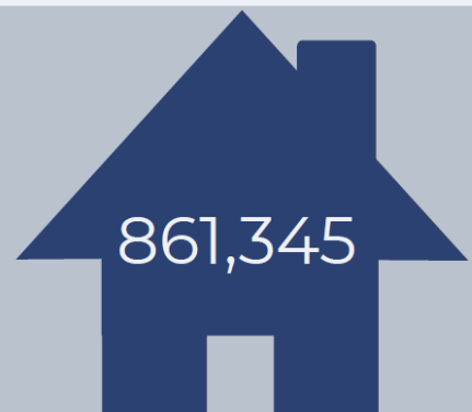
Stock requirement estimate at 2030