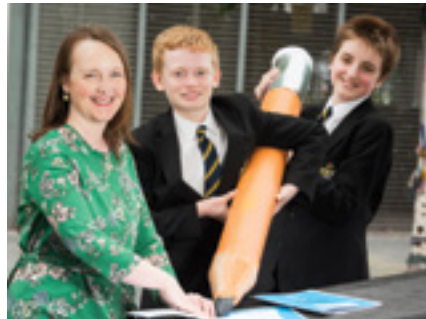
Pupils at Ashfield boys have been putting pen to paper to develop their writing skills

The project engaged ten schools from Urban Village areas with pupils from each school working with professional artists to