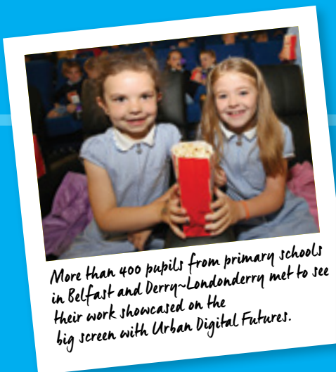
More than 400 pupils from primary schools in Belfast and Derry~Londonderry met to see their work showcased on the big screen with Urban Digital Futures.