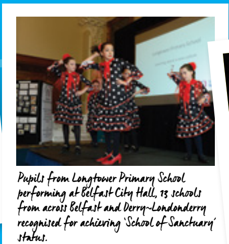
Pupils from Longtower Primary School performing at Belfast City Hall, 13 schools from across Belfast and Derry~Londonderry recognised for achieving 'School of Sanctuary' status.