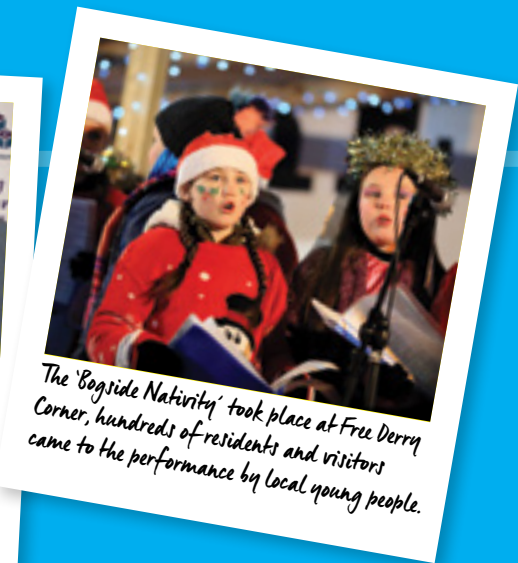
The 'Bogside Nativity' took place at Free Derry Corner, hundreds of residents and visitors came to the performance by local young people.