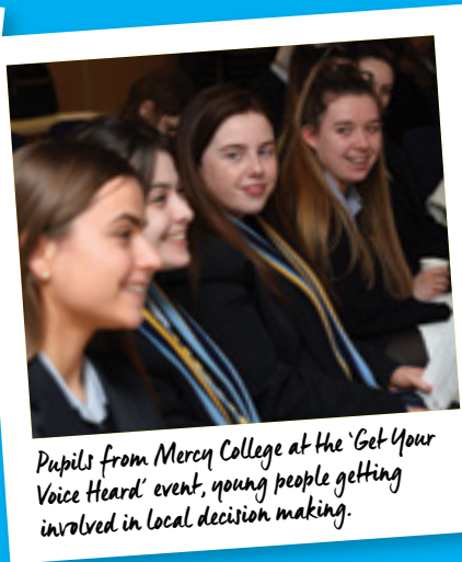
Pupils from Mercy College at the 'Get Your Voice Heard' event, young people getting involved in local decision making.