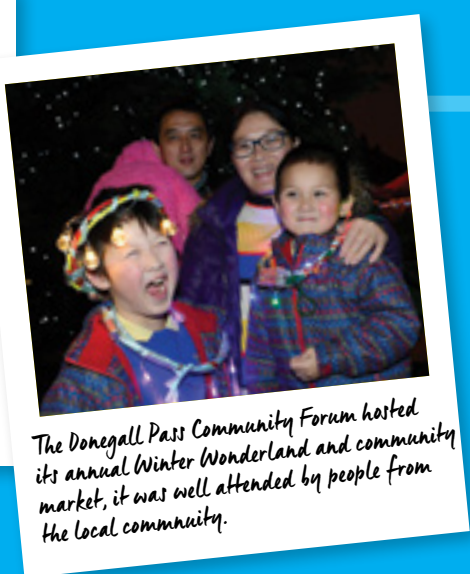
The Donegall Pass Community Forum hosted its annual Winter Wonderland and community market, it was well attended by people from the local community.

Send your best pics to: info@urbanvillagesni.org