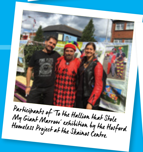
Participants of 'To the Hallion that Stole My Giant Marrow' exhibition by the Hatford Homeless Project at the Skinais Centre.