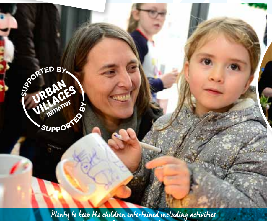
such as arts and crafts, a chocolate factory, storytelling and of course Santa's workshop supplied by Hosford

Special highlights included Santa's Workshop, that showcased Hosford team's efforts, local community crafts from Ballymac Mens Shed, Short Strand Community Centre, the Diamond Project, Walkway Community Association and Hosford, the Scaffolding project supplied tasty treats and EastSide Learning created a reading corner that celebrated the 40th anniversary of Raymond Briggs 'The Snowman'.