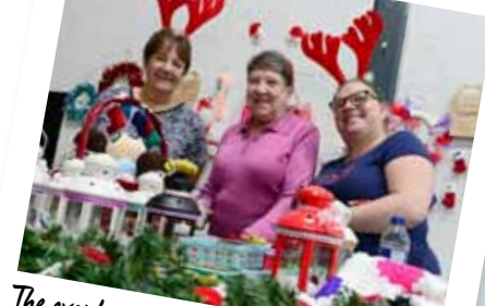
The event included a number of stalls selling hand crafted festive gifts, food and drinks, sweet treats and farm fresh

Representatives from the EastSide Arts and Creativity Sub-Group from different organisations across the Urban Village area taking part in the annual EastSide Christmas Fayre at Skainos Centre.