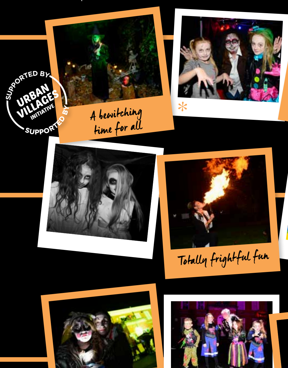
Clowning around together