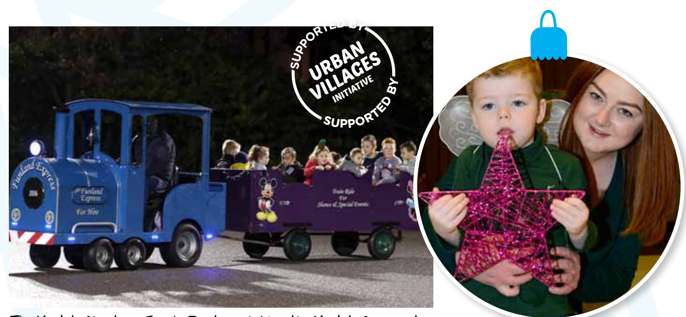
The Markets Christmas Family Event was held in the Markets Community Centre where Santa arrived on his train. The family event was a night of song and dance celebrating the spirit of Christmas.