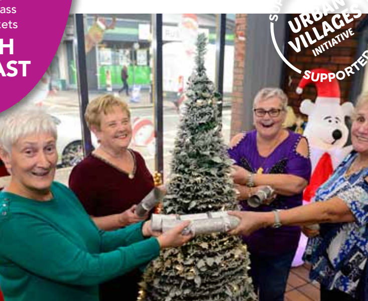
The Sandy Row Residents Association hosted its annual Senior Citizens' Christmas Party at the Sandy Row Community Centre. The event included Christmas dinner with all the trimmings and gifts for all attending.

Sandy Row, Donegall Pass & the Markets SOUTH BELFAST