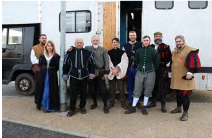
Stair Bheo Éireann ag Féile Creachairí Hamhaig 2017 Living History Ireland at the Hawick Border Reivers Festival 2017