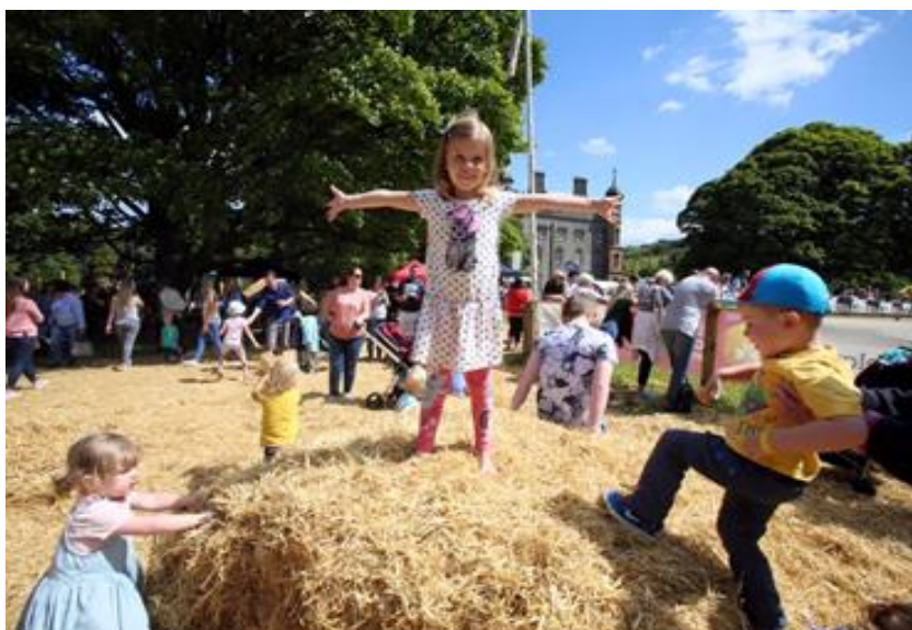
Discover Ulster-Scots Centre Ionad Eolais na hUltaise

The Ulster Scots Agency worked in partnership with Dalriada Festival to promote Ulster Scots to over 28,000 people.