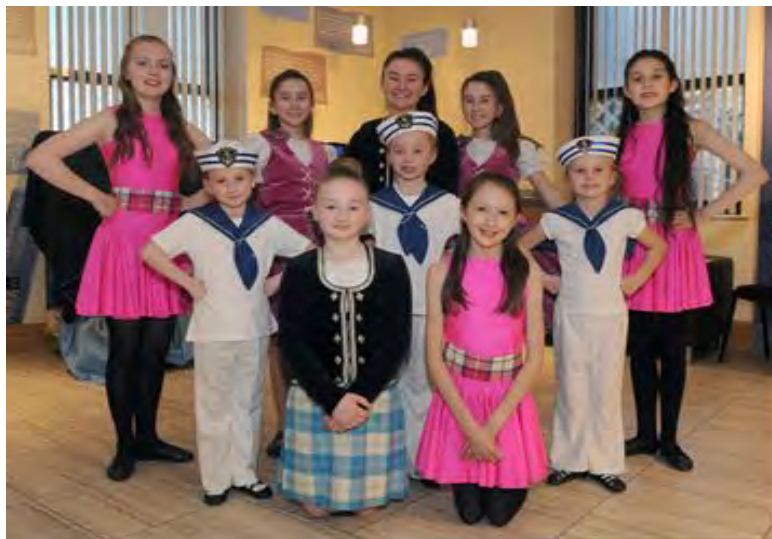
Damhsóirí Garbhchríoch na Soilse Geala ag an Oíche Chultúir, Ionad Eolais na hUltaise, Béal Feirste Bright Lights Highland Dancers at Culture Night, Discover Ulster Scots centre Belfast

Bhí clár siamsaíochta ag Ionad Eolais na hUltaise i gCeathrú na hArdeaglaise i mBéal Feirste mar chuid d'Oíche Chultúir i mBéal Feirste in dtagann 80,000 isteach go Béal Feirste le heispéireas a fháil ar chultúir nua. Bhí an t-ionad i Sráid Victoria oscailte le clár ilghnéitheach a chur i láthair, ina raibh Banna Píob Cuimhneacháin MhicDhòmhnaill, Grúpa Damhsa na Soilse Geala agus taispeántais den cheol gormfhéir. Bhí níos mó daoine ann ná mar a bhíodh le blianta beaga anuas.