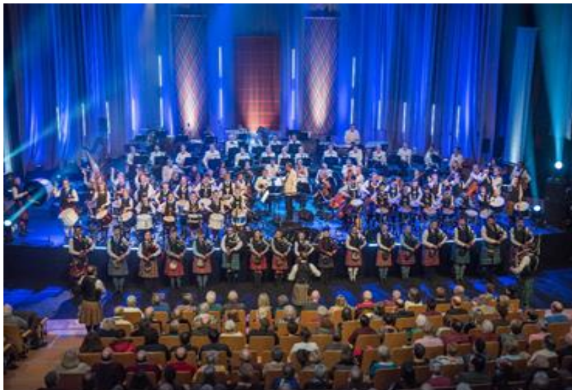
The Ulster Scots Agency Juvenile Pipe Band perform with the Ulster Orchestra at the 2017 Burns Concert at the Waterfront Hall, Belfast.