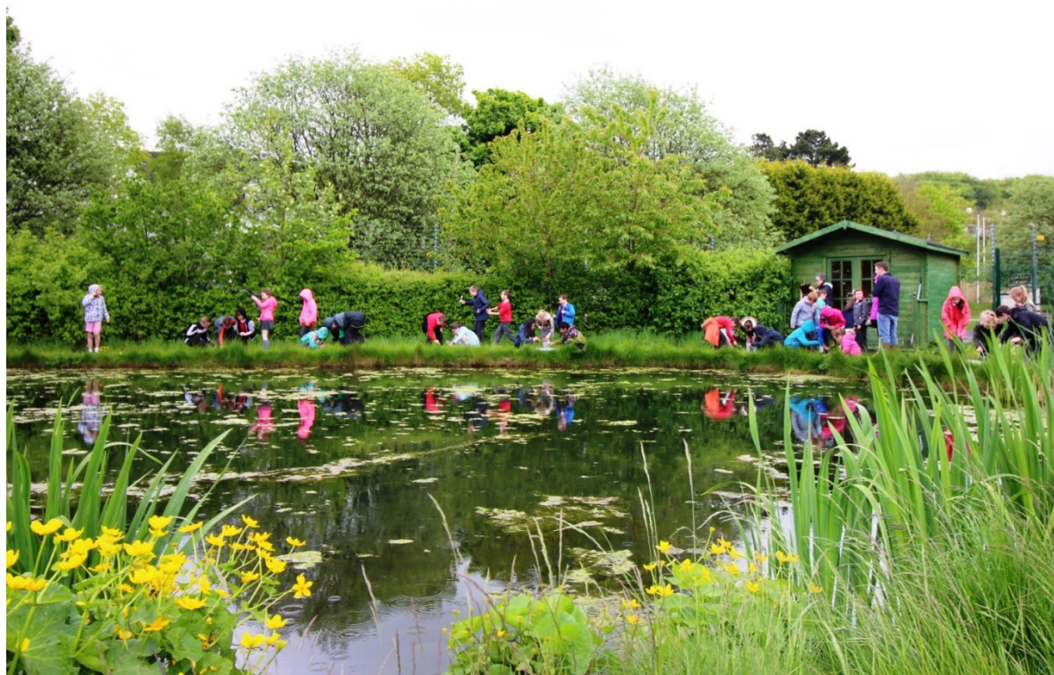
Primary school pupils pond dipping at Loughs Agency

An NSMC Aquaculture and Marine meeting was held on 14 September 2016 in Armagh. The meeting was attended by Denis Naughten TD, Minister for Communications, Climate Act and Environment, Michelle McIlveen MLA, Minister of Agriculture, Environment and Rural Affairs, Seán Kyne TD, Minister of State for Gaeltacht Affairs and Natural Resources and Chris Hazzard MLA, Minister for Infrastructure.