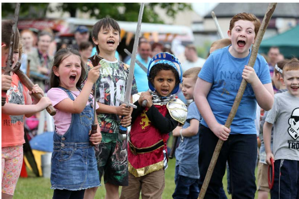
Soldiers of the King – Bruce Medieval Festival June 2016