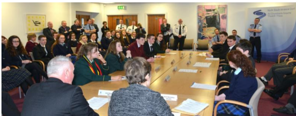
Students discuss road safety in mock NSMC Plenary format at a schools outreach seminar

On the 16 January, the Joint Secretariat hosted a Schools Outreach Seminar involving 50 students in the 16 to 17 year old age group from secondary schools in Armagh, Monaghan and Louth. The theme of the seminar was 'Road Safety and it was run in co-operation with the Armagh PSNI and An Garda Síochána from Monaghan Traffic Unit. Presentations were given by both the PSNI and An Garda, followed by student group discussions on ways to reduce the number of road accidents and how road users may be educated in the promotion of road safety. In order to develop the participating students' knowledge of the work of the NSMC, the final session of the half day interactive seminar consisted of a mock NSMC Plenary meeting which saw students enthusiastically playing the role of Ministers of the Irish Government and the Northern Ireland Executive at which they discussed road safety issues and put forward key action points. The event provided an excellent opportunity to enhance inter-agency and cross-jurisdictional relationships in this field.