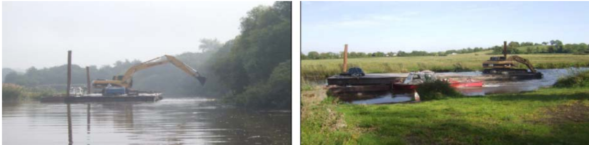
Dredging on the River Finn to create navigation for the Ulster Canal

At the November meeting, Ministers noted that the first phase of the work, the dredging of the River Finn to create navigation was nearing completion. Detailed site investigation of the canal route and the new bridge at Derrykerrib had identified extremely poor and challenging ground conditions. Work will continue to progress this element of the project in 2015.