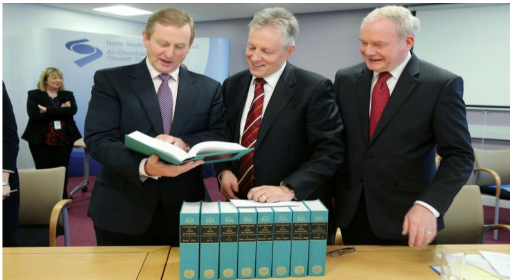
Taoiseach Enda Kenny TD, First Minister Rt Hon Peter Robinson MLA and deputy First Minister McGuinness MLA at presentation to outgoing First Minister Robinson at his last NSMC Plenary in Armagh on 11 December 2015

At both meetings the Council noted the position on Sectoral Priorities and the ongoing review of Work Programmes across the six areas of co-operation. It was agreed that this topic would be kept under active review.