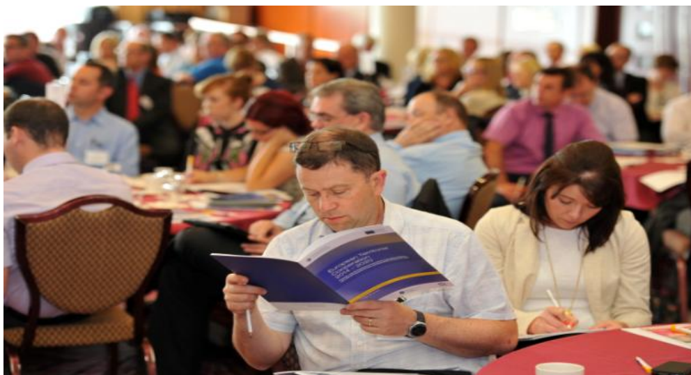
Delegates at an SEUPB led Workshop exploring new funding opportunities

An NSMC SEUPB meeting was held in Armagh, on 11 December. The meeting was attended by Richard Bruton TD, Minister for Jobs, Enterprise and Innovation, Arlene Foster MLA, Minister for Finance and Personnel, and OFMDFM Junior Minister Jennifer McCann MLA.