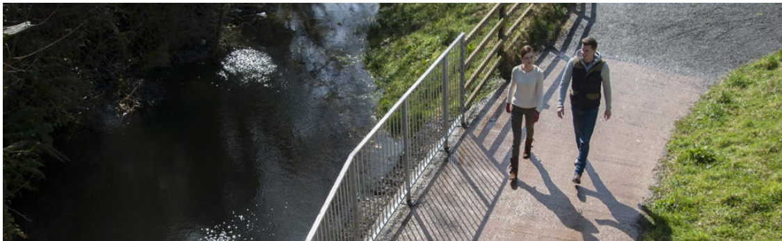
Section of the Ulster Canal Greenway on the outskirts of Monaghan town

On 30 April, the Joint Secretariat hosted an information sharing and networking seminar on Greenways and Blueways for the North South Bodies. The purpose of the event was to provide a forum primarily for North South Bodies to share practical experience and best practice, network and develop new partnerships for the purpose of facilitating a more ‘joined-up/co-ordinated’ approach to the provision of a cross-border network of Greenways/Blueways. Department of Regional Development and Department of Transport, Tourism and Sport officials also gave a joint presentation.