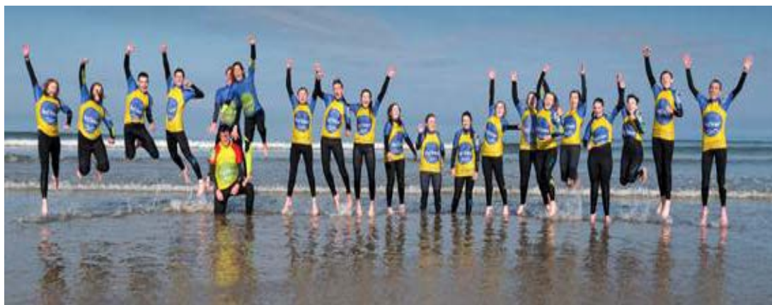
Participants on the Loughs Agency's Foyle Ambassador Programme

NSMC Aquaculture and Marine meetings took place on 27 May and 11 November in Armagh. The meetings were attended by Michelle O'Neill MLA, Minister of Agriculture and Rural Development, Mervyn Storey MLA, Minister for Social Development and Joe McHugh TD, Minister of State at the Department of Communications, Energy and Natural Resources.