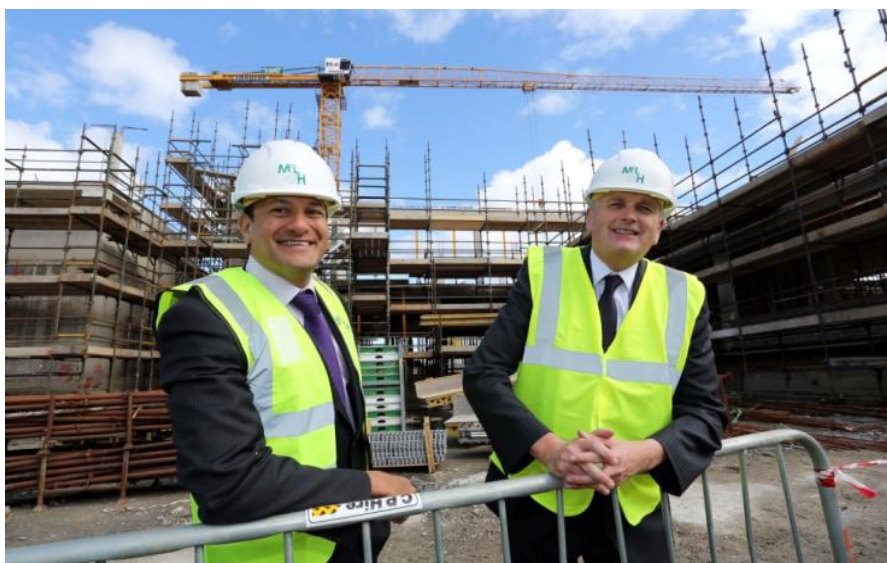
Health Ministers Varadkar and Wells inspect progress at the new Radiotherapy Unit at Altnagelvin

An NSMC Health meeting was held at Altnagelvin Area Hospital on 15 April. Jim Wells MLA, then Minister of Health, Social Services and Public Safety, Leo Varadkar TD, Minister of Health and Michelle O'Neill MLA, Minister of Agriculture and Rural Development attended the meeting.