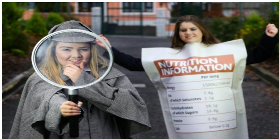
“Food detectives” take a closer look at food nutrition labels using the “What’s on a Label” Education Resource