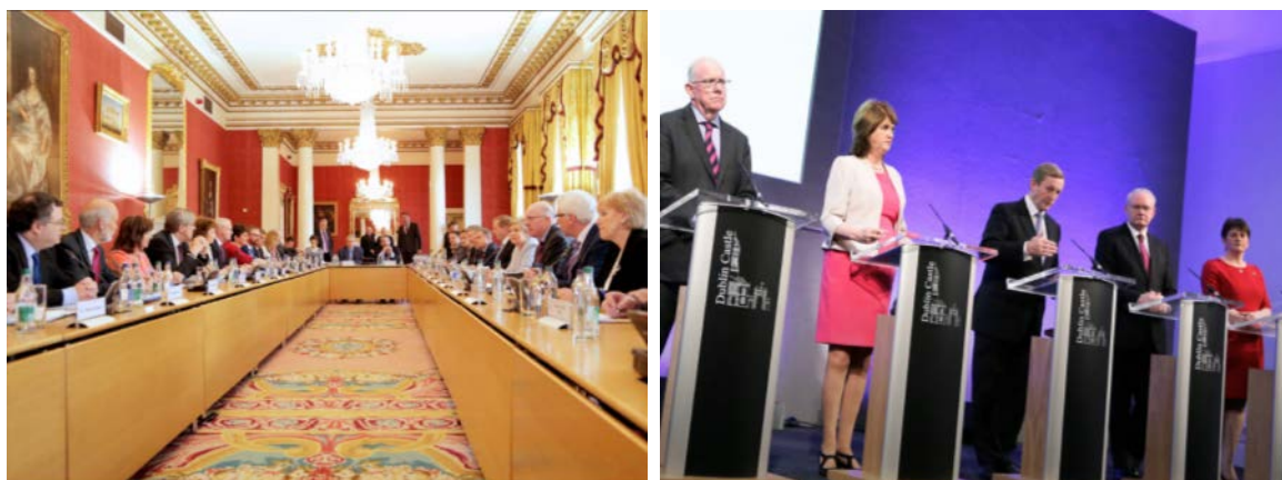
The NSMC Plenary in Dublin Castle, 5 June 2015

NSMC Plenary meetings involve Northern Ireland Executive Ministers meeting with their counterparts in the Irish Government to take an overview of co-operation on the island and of the North South institutions. There were two NSMC Plenary meetings in 2015, the first on 5 June in Dublin Castle and the second on 11 December at the NSMC Joint Secretariat Offices in Armagh.