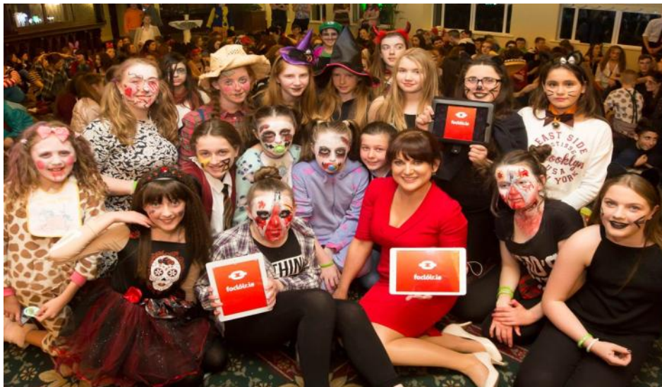
Students celebrating the launch of the new app for the English-Irish dictionary at the Halloween Oireachtas na Gaeilge event