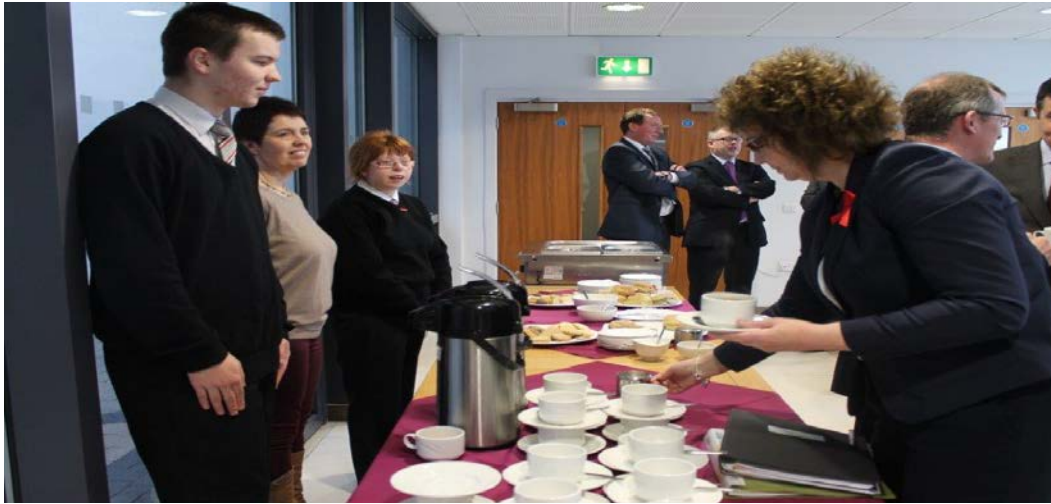
Pupils from Lisanally Special School serving refreshments to Ministers at the NSMC Transport meeting