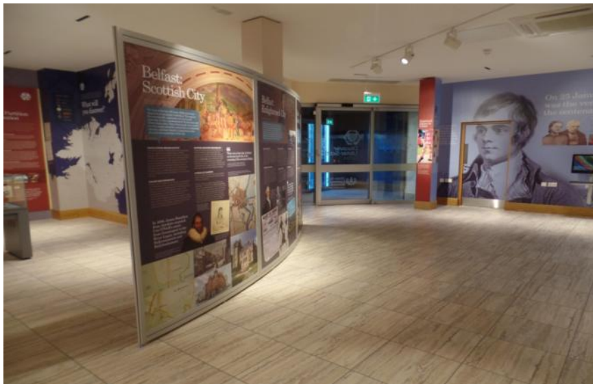
New Discover Ulster-Scots Centre, Corn Exchange Building, Belfast