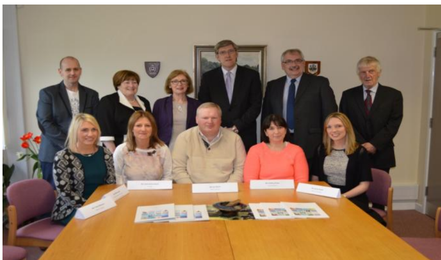
Education Ministers O’Sullivan and O’Dowd meet with staff at the Middletown Centre for Autism

NSMC Education meetings took place on 25 March and 11 December in Armagh. John O’Dowd, MLA, Minister for Education, Jan O’Sullivan, TD, Minister for Education and Skills and Mervyn Storey, MLA, Minister for Social Development, attended the March meeting. Damien English, TD, Minister of State at the Department of Education and Skills, John O’Dowd, MLA, Minister for Education and Michelle McIlveen, MLA, Minister for Regional Development attended the December meeting.