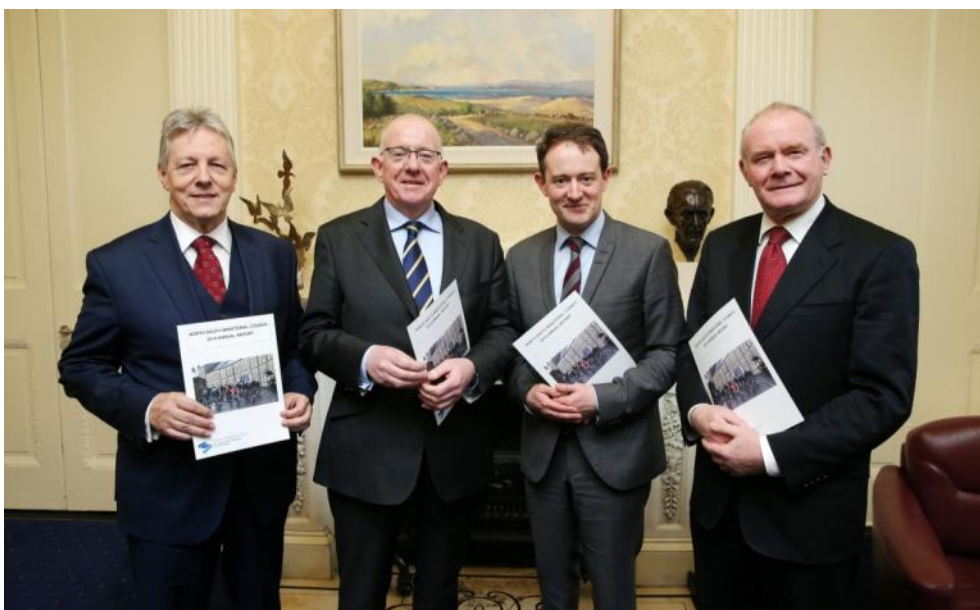
First Minister Rt Hon Peter Robinson MLA, Minister Charlie Flanagan TD, Minister of State Seán Sherlock TD, and deputy First Minister Martin McGuinness launching the NSMC 2014 Annual Report at the NSMC Institutional Meeting in Stormont Castle in February 2015.

Ministers discussed a range of issues including the economic outlook for both economies. The importance of connectivity in encouraging economic growth was particularly highlighted.