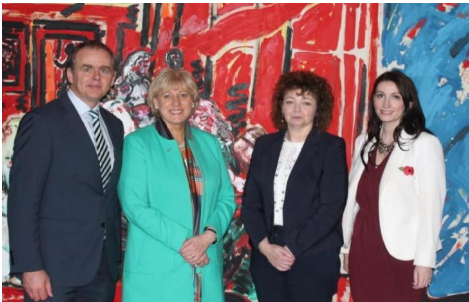
Minister Joe McHugh, TD, Minister Heather Humphries, TD, Minister Carál Ní Chuilín, MLA and Minister Emma Pengelly, MLA at NSMC Language meeting held in the Tyrone Guthrie Centre, Monaghan in November 2015

NSMC Language Body meetings took place in Belfast and Monaghan on 10 June and 6 November respectively. Heather Humphreys TD, Minister for Arts, Heritage and the Gaeltacht and Joe McHugh TD, Minister of State with special responsibility for Gaeltacht Affairs, Carál Ní Chuilín MLA, Minister of Culture Arts and Leisure attended both meetings, while OFMDFM Junior Minister Michelle McIlveen MLA and Junior Minister Emma Pengelly, MLA attended the June and November meetings respectively.