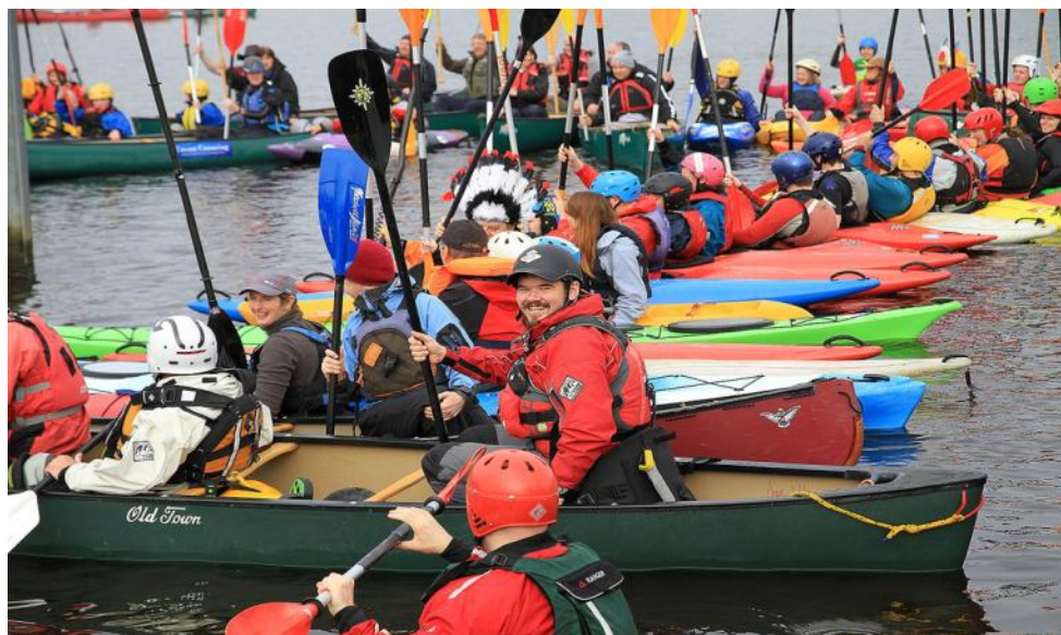
Participants at the Waterways Ireland sponsored Killaloe Water Festival on the Shannon in September 2015

NSMC Inland Waterways meetings took place in Belfast and Monaghan on 10 June and 6 November respectively. Heather Humphreys TD, Minister for Arts, Heritage and the Gaeltacht and Joe McHugh TD, Minister of State with special responsibility for Gaeltacht Affairs, Carál Ní Chuilín MLA, Minister of Culture Arts and Leisure attended both meetings, while OFMDFM Junior Minister Michelle McIlveen MLA Junior Minister Emma Pengelly, MLA attended the June and November meetings respectively.