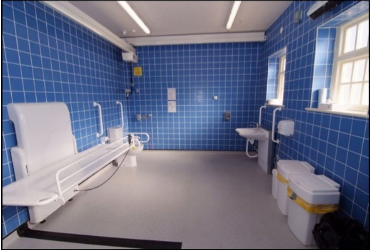
Example of a Changing Places Toilet facility.