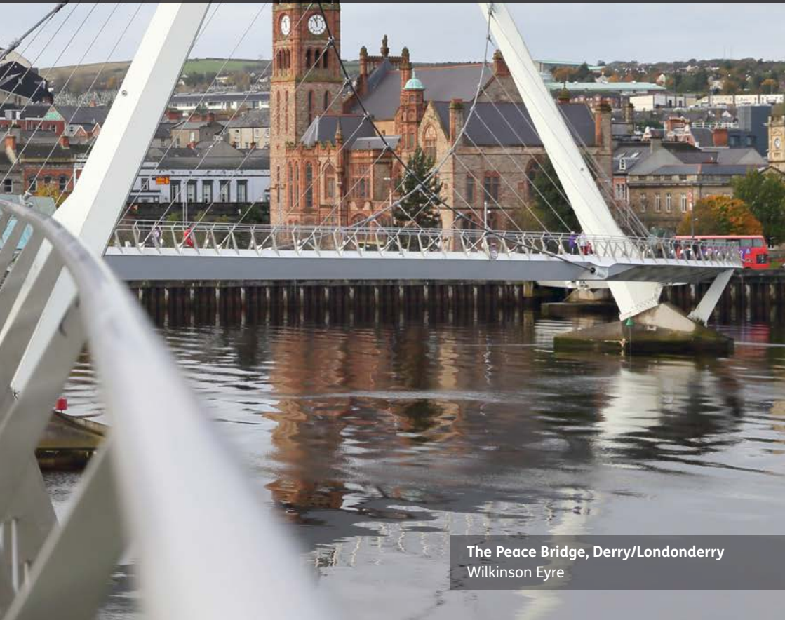
The Peace Bridge, Derry/Londonderry