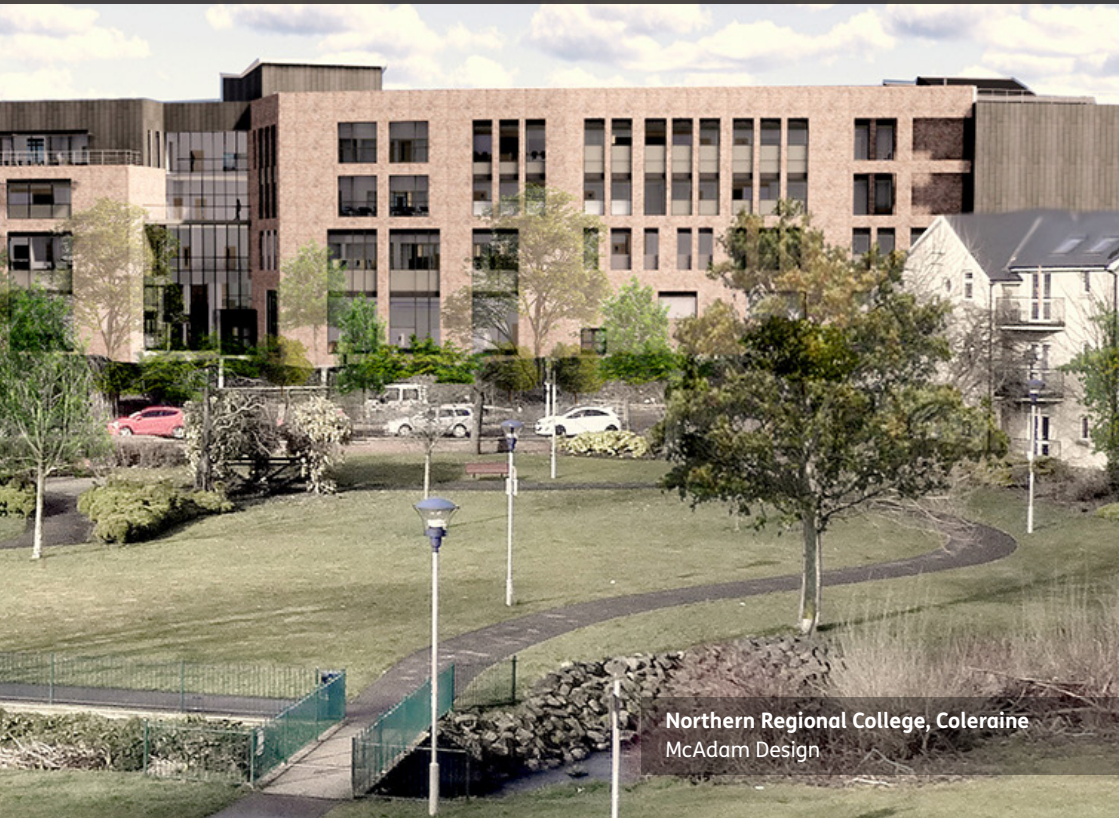
Northern Regional College, Coleraine McAdam Design