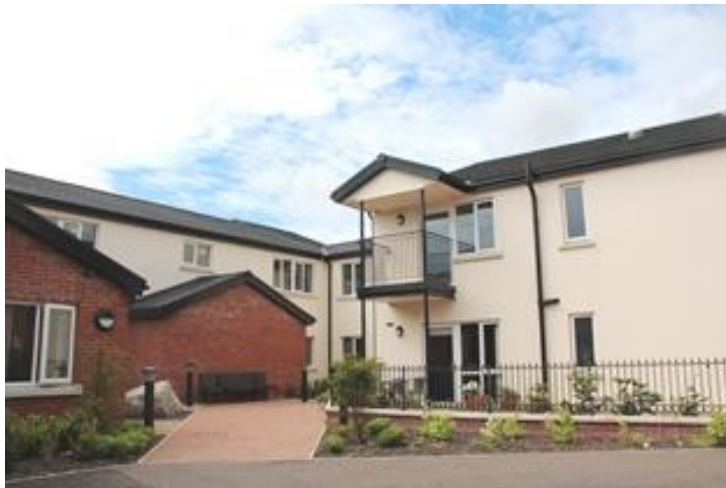
Picture 2 – Cuan Court, Newtownards

The Trust is currently developing a Business Case with Supporting People for a new accommodation scheme on the former Ravara House site in Bangor.