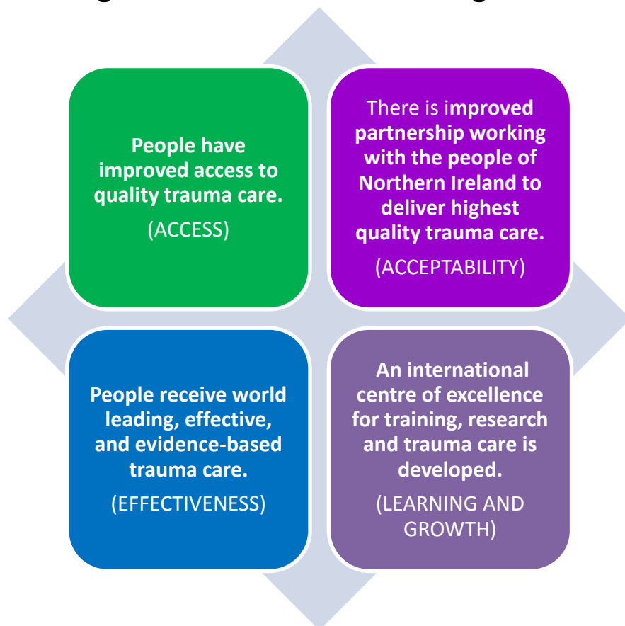
Diagram 3: Regional Trauma Network Strategic Outcomes