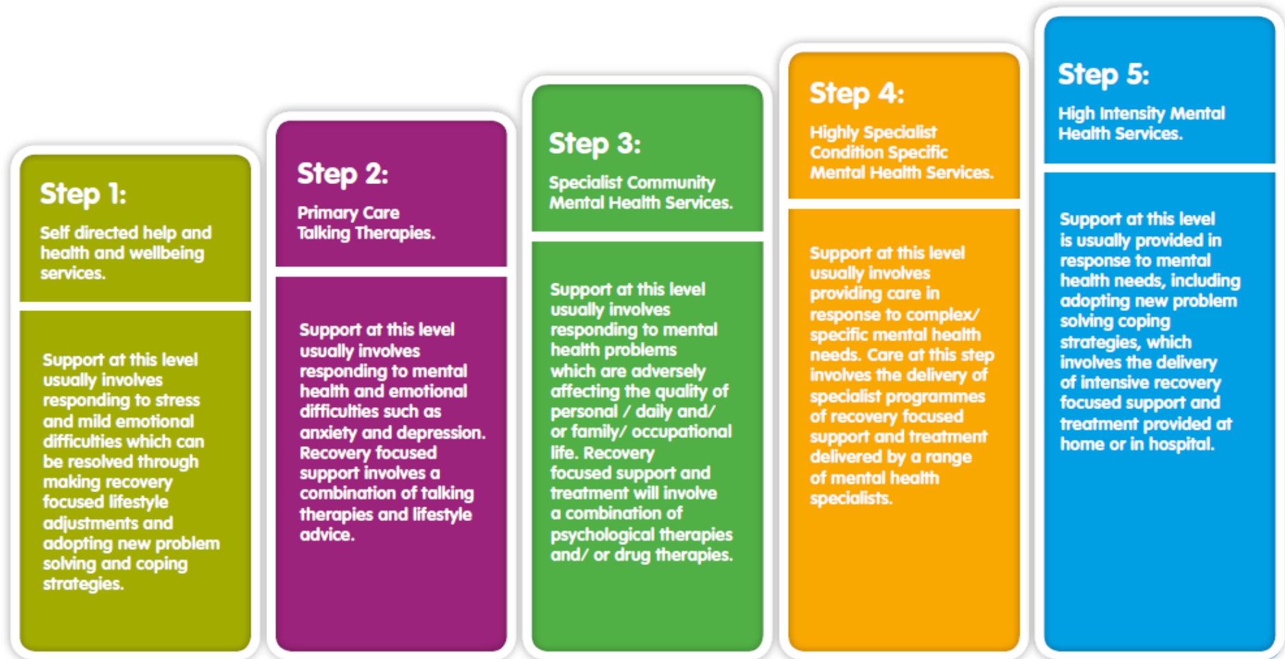
Diagram 2: Stepped Care Model 19