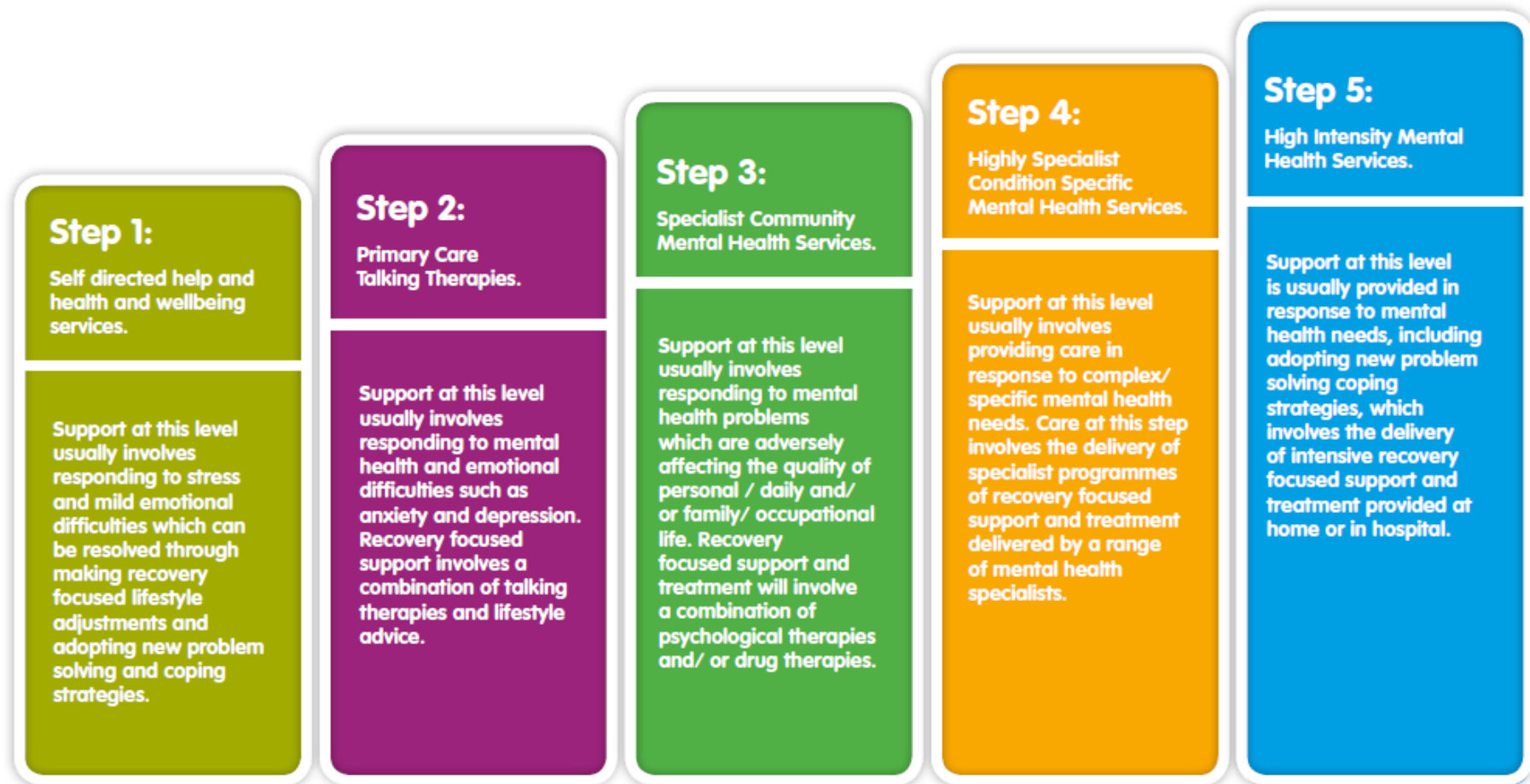
Diagram 1: Stepped Care Model 5