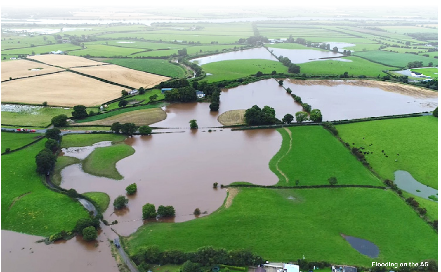
Flooding on the A5

Any queries on the technical guidance should be directed to waterpolicy@infrastructure-ni.gov.uk and any queries in respect of DfI Rivers advice on flood risk should be directed to riversplanningmailbox@nigov.net or by phone: 028 3839 9118.