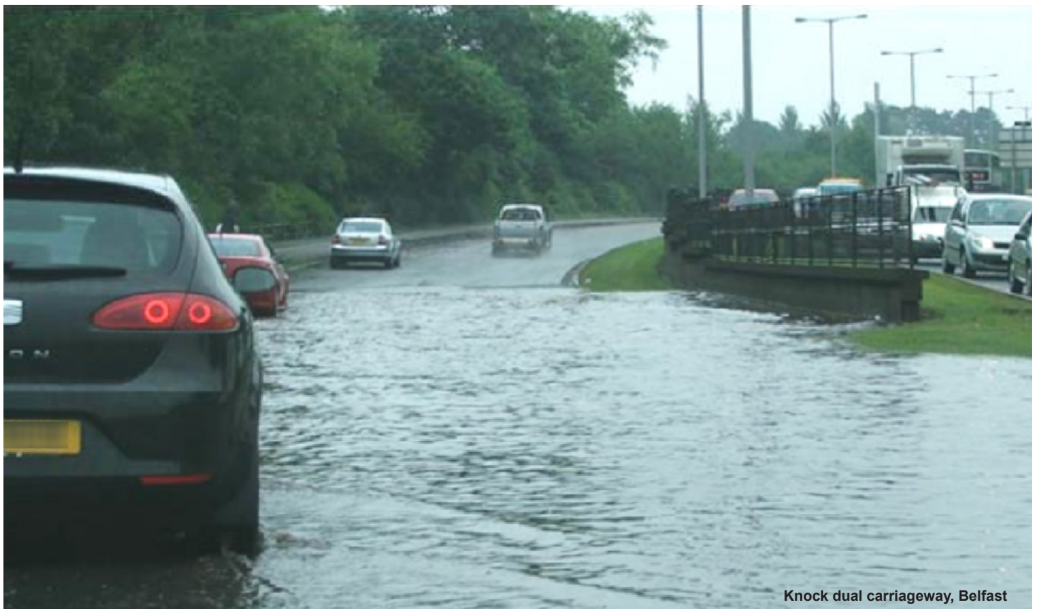
Knock dual carriageway, Belfast

Runoff Flows are calculated in accordance with the DMRB Chapter 7, Paragraphs 7.6 to 7.8, taking into account the preceding advice on Allowance for Climate Change.