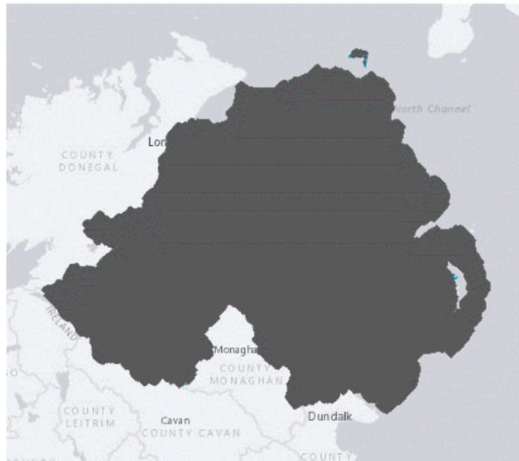
Figure 1 - Basic Broadband Coverage