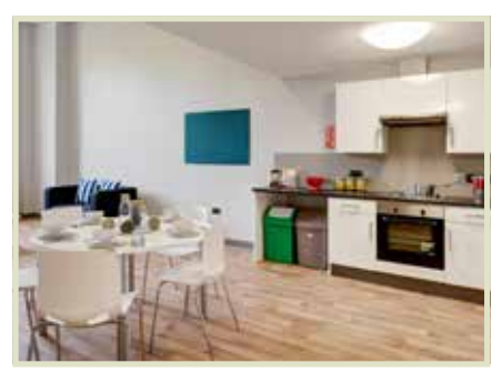
Garbage should be removed from the premises at least twice weekly and should not be stored in the kitchen area.

Campus Accommodation may provide one or more kitchen areas for use by the establishment to provide meals for visitors or; provide one or more kitchens for use by visitors to prepare meals. Where provided, the kitchen together with any associated service areas should contain facilities, fittings and equipment of good quality and condition, which are easily cleaned. These should be adequate for the storage, refrigeration, preparation, cooking and service of food for the maximum number of visitors capable of being seated in the dining area and adequate for the storage and cleaning of all associated utensils. The kitchen must also be adequately ventilated and adjacent to, or easily accessible from a dining area.