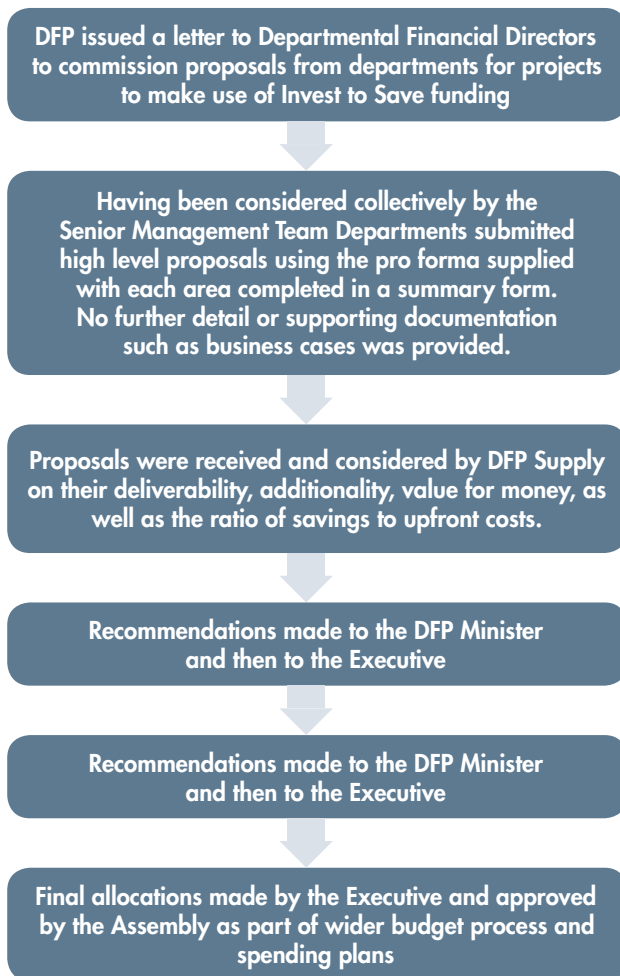
Figure 2: Overview of Invest to Save schemes' bidding and funding allocation process